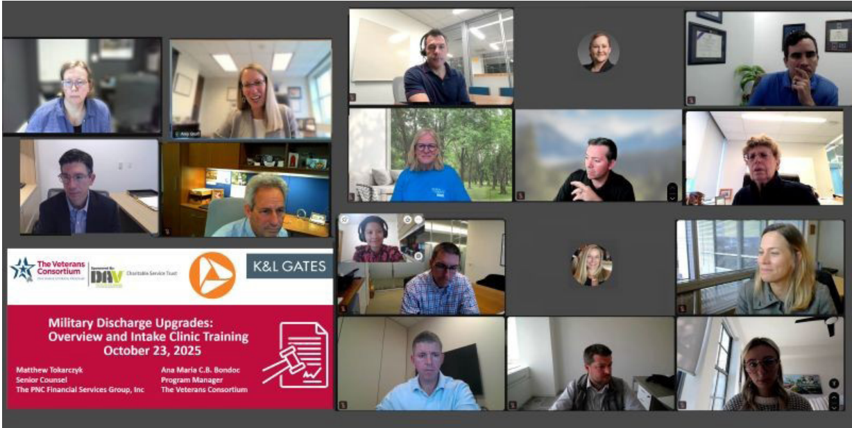
Volunteers participating in a virtual clinic befitting veterans.

traumatic brain injury; Don't Ask, Don't Tell; or military sexual trauma. These upgrades are important because they can restore access to vital VA benefits, improve employment and education opportunities, and help remove stigma that unfairly diminishes a veteran's service and reputation.