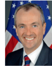
Philip D. Murphy US Ambassador to Germany

In August 2009, the US Senate confirmed Philip Murphy as the US Ambassador to Germany. From 1993 to 1997, Murphy headed the Frankfurt office of Goldman Sachs in Germany, overseeing all of the investment bank's activities in central Europe. Following his long career at Goldman Sachs, Murphy served from 2006 to 2009 as national finance chair of the Democratic National Committee. He has also been co-chair of a task force at the Center for American Progress and the Institute for America's Future.