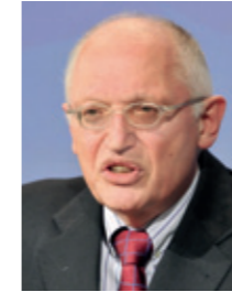
Günter Verheugen Former Vice President of the European Commission