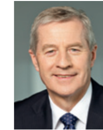
Jürgen Fitschen Co-Chairman of the Management Board, Deutsche Bank AG

Jürgen Fitschen was named co-chairman of the Management Board and the Group Executive Committee of Deutsche Bank on June 1, 2012. He has been a member of Deutsche Bank's Group Executive Committee since 2002. In 2004, he became responsible for the newly created Regional Management division based in Frankfurt and was named CEO of Deutsche Bank for Germany. In 2009, he was appointed to the Management Board of Deutsche Bank AG. Fitschen is also a member of the Supervisory Board of Metro AG as well as the Board of Directors of Kühne+Nagel International AG.