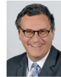
Hans-Joachim Otto Parliamentary State Secretary, Federal Ministry of Economics and Technology

A member of the German Bundestag, Hans-Joachim Otto was named parliamentary state secretary in the Federal Ministry of Economics and Technology in October 2009. He is a member of the FDP Federal Executive Committee and was the spokesperson for the FDP parliamentary group from 1998 to 2005. He subsequently served as chairman of the Bundestag Committee on Cultural and Media Affairs until 2009. In March 2010, Otto was also named the Federal Government Coordinator for the Maritime Industry.